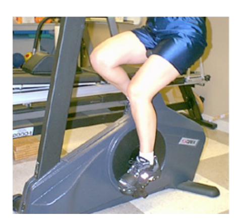
Figure 6. Stationary Bicycle helps to increase strength

1) Stationary Bicycle. Use a stationary bicycle two times a day for 10 - 20 minutes to help increase muscular strength, endurance, and maintain range of motion. See Figure 6: