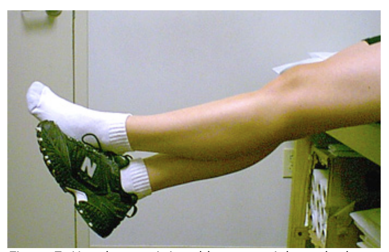
Figure 7. Use the non-injured leg to straighten the knee

2) Active-assisted extension is performed by using the opposite leg and your quadriceps muscles to straighten the knee from the 90 degree position to 0 degrees. Hyperextension should be avoided during this exercise. See Figure 7: