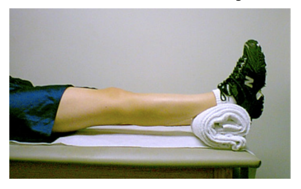
Figure 1. Heel prop using a rolled towel.