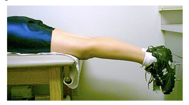
Figure 2. Prone Hang. Note the knee is off the edge of the table.