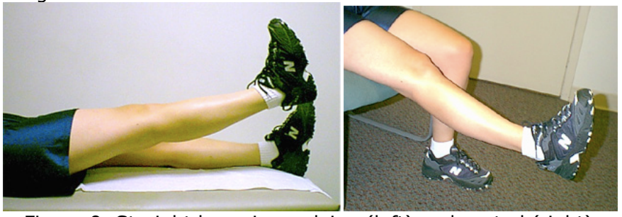
Figure 9. Straight leg raises – lying (left) and seated (right)

This exercise can be performed out of the brace when the leg can be held straight without sagging (quad lag). Once you have gained strength, straight leg exercises can be performed while seated. See Figure 9: