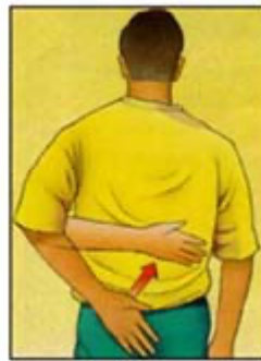
Shoulder Internal Rotation (Active)