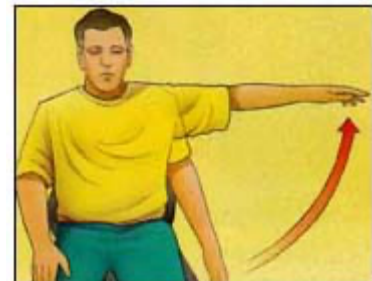
Shoulder Abduction (Active)