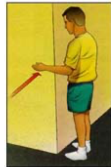
Shoulder Internal Rotation (Isometric)