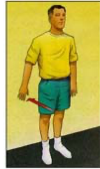
Shoulder Extension (Isometric)