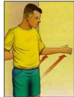
Shoulder External Rotation (Isometric)