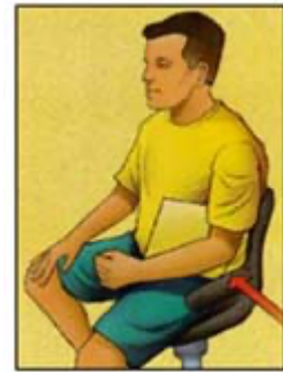
Shoulder Adduction (Isometric)