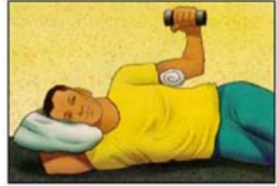
Shoulder External Rotation