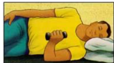
Shoulder Internal Rotation