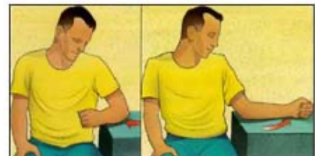
Supported Shoulder Rotation