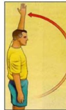
Shoulder Flexion (Active)