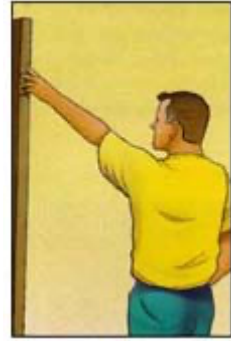
Walk Up Exercise (Active)