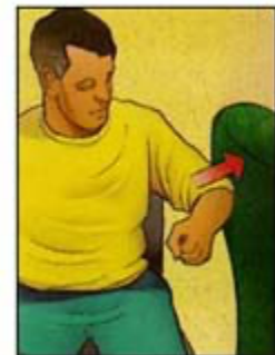
Shoulder Abduction (Isometric)